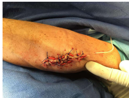
Figure 2 Photograph of the patient's left elbow showing the lesion closed with retention stitches. The stitches are passed through 0.5 cm segments that were cut from a narrow rubber tube, which are bolsters that serve to distribute stress so that the stitches do not cut through the skin.

After piperacillin/tazobactam was started, the wound started to granulate well and was closed after 18 days of treatment with this antibiotic. Closure included a Z-plasty and retention stitches with bolsters which enabled closure of the retracted skin margins