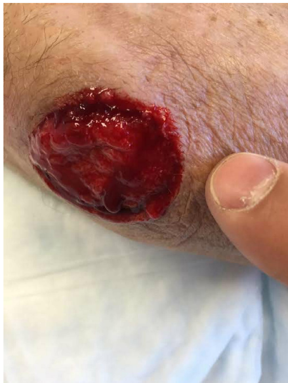
Figure 1 Photograph of the patient's left elbow. The open wound exposes the olecranon bursa region, but the bone was never exposed during the entire course of treatment.

been started by the surgeon. This treatment was continued for 2 weeks. No addition cultures were obtained. Because of continuing drainage and the lack of the expected robust erythematous granulation tissue, ertapenem (1 g once daily) was then added and this two antibiotic treatment was continued for an additional 2 weeks. However, the clinical response to this double antibiotic treatment continued to be poor. Because of this an infectious disease specialist (MRO) was consulted. The consultant stopped ertapenem and started piperacillin/tazobactam 4.5 g intravenously every 8 hours. This change was based on data showing that this penicillin-based antibiotic with a beta-lactamase inhibitor would provide coverage for P. acnes in addition to: (1) continuing broad-spectrum coverage primarily for the possibility that another pathogen (in addition to S. epidermidis ) was present but did not grow in subsequent cultures and (2) more aggressively treating the olecranon osteomyelitis. 4,5