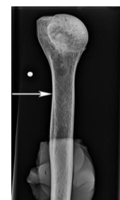
Figure 2. (far right image) The 5.0mm radio-opaque (white) circle indicates the lateral side of the humerus. The arrow indicates where the rater marked the proximal location of the deltoid tuberosity according to Spross et al. (2015) definition.