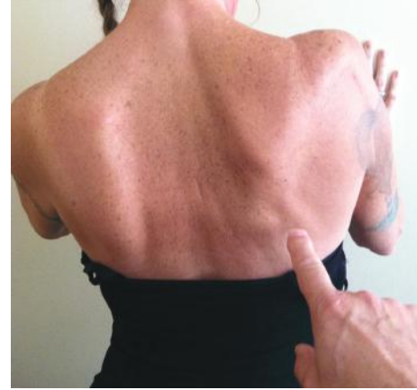
FIGURE 4: Photo taken 18 months after the index TSA shows the patient's back while she presses her hands against the wall in front of her. Although scapular winging is still obvious, there is increased mass of the trapezius when compared to the image taken 14 months prior (Figure 1). Although periscapular muscle tone had improved, shoulder function was not significantly changed.

(2) the pectoralis major muscle (not examined in the first study) showed motor unit changes consistent with previous axonal loss with reinnervation, and (3) motor units in the upper, middle, and lower portions of the trapezius muscle were present, which was considered an indication of improvement. Consultation with another physical therapist was then obtained because of the patient's continuing complaints of "intolerable pain" during physical therapy sessions, which