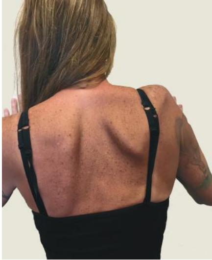
FIGURE 5: Photo taken 24 months after the index TSA shows the patient's back while she presses her hands against the wall in front of her. The trapezius atrophy has worsened and the lateral scapular winging is more pronounced than six months prior (Figure 4).

No additional surgery was planned and the patient was highly unsatisfied with her shoulder function (Figure 5).