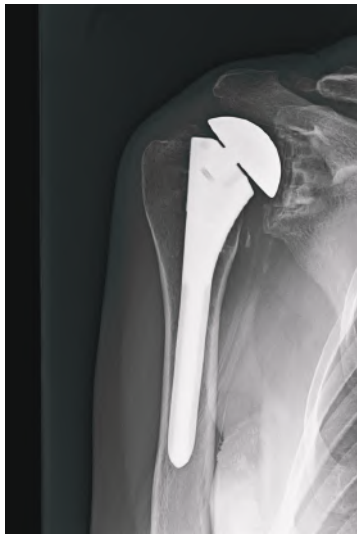
FIGURE 3: Anterior-posterior radiograph of the patient's right shoulder taken eight months after the revision of the humeral head (16 months after the index TSA). Narrowing of the distance between the acromion and the humeral head seen in this image is suggestive of weakness or a tear of the superior rotator cuff [28].

(2) the pectoralis major muscle (not examined in the first study) showed motor unit changes consistent with previous axonal loss with reinnervation, and (3) motor units in the upper, middle, and lower portions of the trapezius muscle were present, which was considered an indication of improvement. Consultation with another physical therapist was then obtained because of the patient's continuing complaints of "intolerable pain" during physical therapy sessions, which